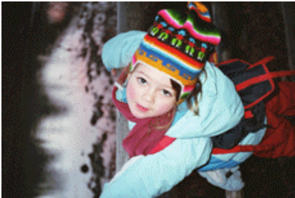
overview from below ©Tamuna Markgraf<|>2007