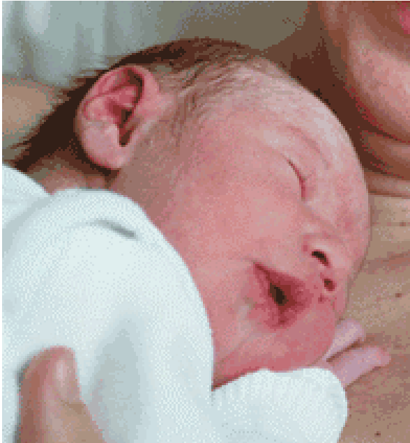
new life